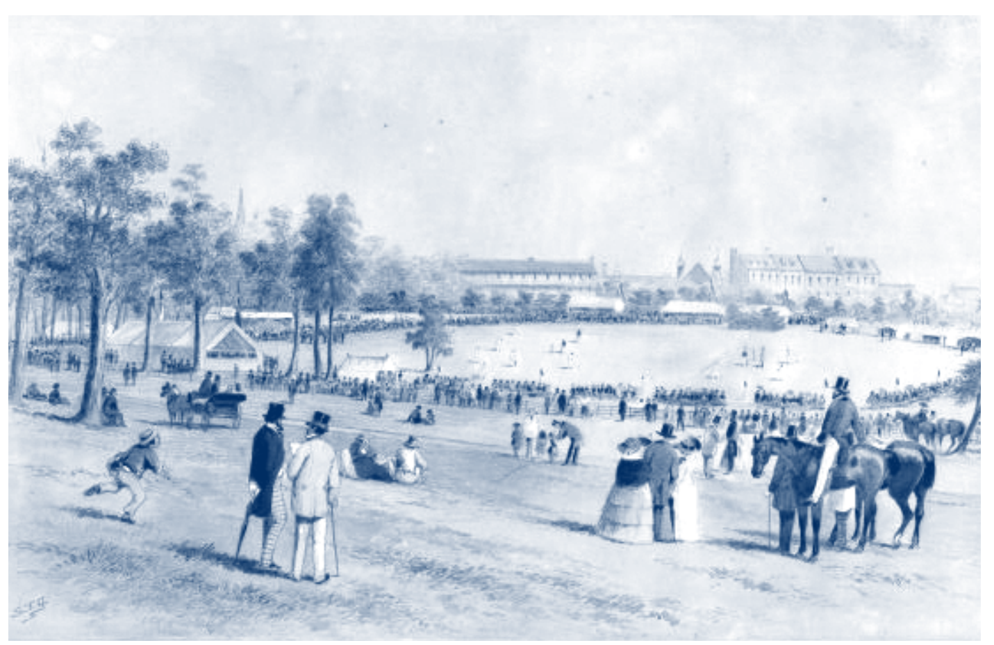
THE FIRST CRICKET MATCH BETWEEN NEW SOUTH WALES AND VICTORIA, PLAYED IN THE SYDNEY DOMAIN IN JANUARY 1857, BY S.T. GILL.

sentence rather than pay a fine', thinkbox 'the head', toes up 'dead', toe 'to kick', t'other side 'WA', up 'upset', vandemonianism 'rowdiness', yabberer 'a chatterer'.