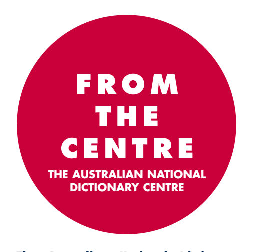
The Australian National Dictionary Centre is jointly funded by Oxford University Press Australia and The Australian National University to research all aspects of Australian English and to publish Australian dictionaries and other works.

The new edition adds about three dozen loan words that have general currency, and for which it has been possible to discover